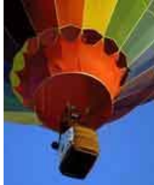
Club Leadership Plan